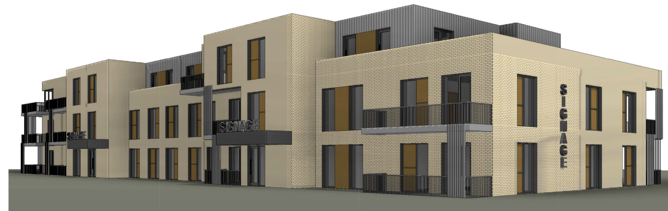
2 3D View 1..

NOTE: Levels shown on architectural block plans relate to local Ground Floor Level and do not relate to Ordnance Datum. For Finished Ground Floor Levels related to Ordnance Datum see DBFL Engineers drawings numbered: 180002-2000 Roads Layout / 180002-2001 Roads Layout Sheet 1 / 180002-2002 Roads Layout Sheet 2